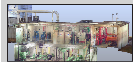
3D Scanning enables the clients and project stakeholders to identify and better understand current conditions prior to planning for upgrades or additions.

A laser scan captures millions of individual 3D points along with photographic information for each of those points. Accurate measurements of an area can be obtained by using dimension tools within the scan data. Project team members can measure anything within the project area at any time without additional site surveying. The 3D scanned data provides photographic and dimensional verification of the existing conditions which eliminates guesswork and ensures accuracy of cost estimates.